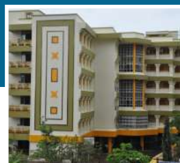
Dr. S. Radhakrishnan International School Malad (West)