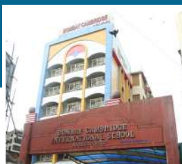
Bombay Cambridge International School Andheri (West)