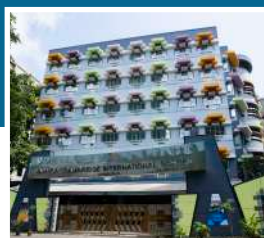
Bombay Cambridge International School Andheri (East)