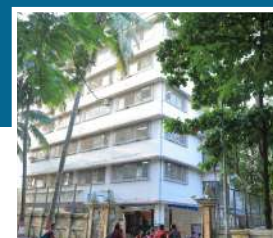
Veer Bhagat Singh International School Malad (West)