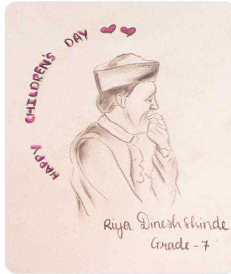
Submitted by Riya Shinde Class 7