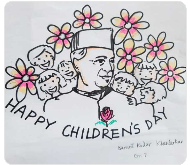
Submitted by Nirmeet Khandekar Class 7